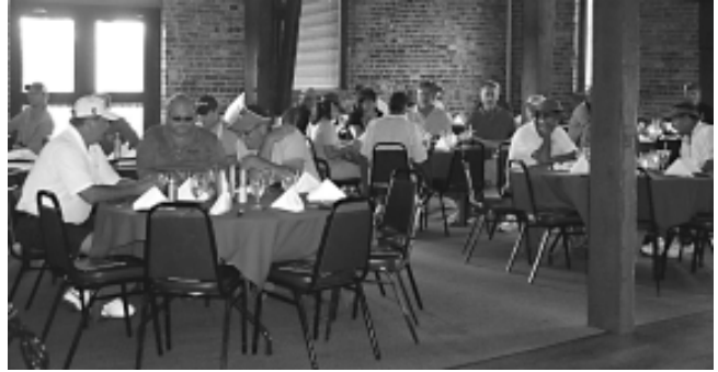
An early evening steak dinner in the Glenview dining room followed the tournament.