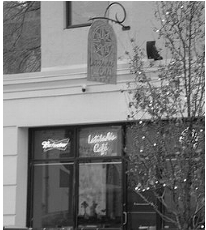
Latitudes Milford location

If you're not acquainted with Latitudes, it's a tapas bar with a menu featuring such items as crab cakes, Yukon gold potatoes (with honey curry mayo and sweet red chili sauce), Asian