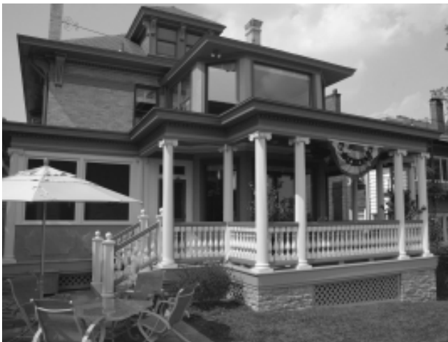
The porch addition that won a regional CotY award in the Residential Exterior Over $100,000 category for Kessler Construction Services fit seamlessly with the architectural style of the 1910 home.

Members of Miami Valley NARI won five regional CotY awards, bringing a total of seven regional CotYs to southwest Ohio.