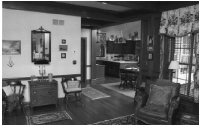
Eliminating a walk-in pantry and a brick wall created a wide open kitchen-dining room-family room area.