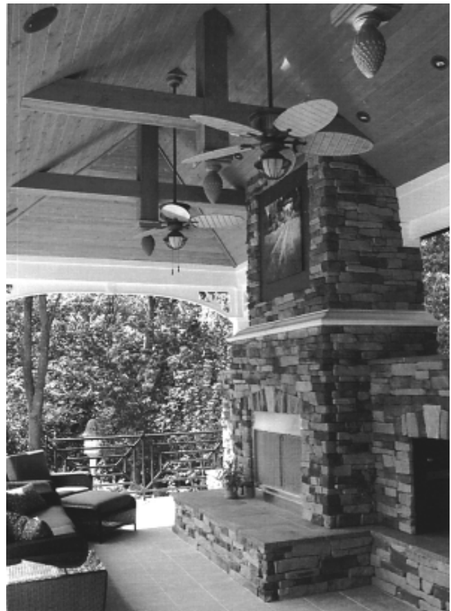
This spectacular fireplace is part of an outdoor living room that brought a national CotY Award in the Residential Specialty category to Neal's Design & Remodel.

Again Neal's Design & Remodel came up with a local CotY award winning project, this time in the Residential Specialty (Exterior Addition) category. The project subsequently