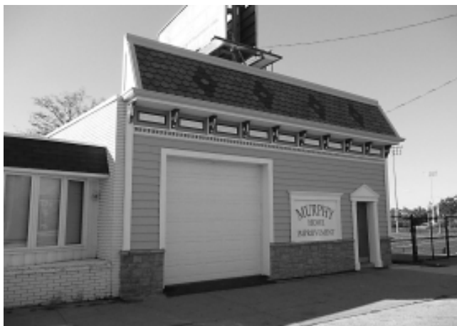
Murphy Home Improvement won local, regional, and national CotY recognition for the exterior remodel of the firm's own building.

won the Region IV award in the Residential Exterior Specialty Category, then was named as the national winner.