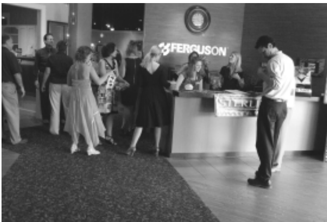
Casino night guests received a warm reception at the Ferguson Enterprises Kitchen, Bath & Lighting Showroom.