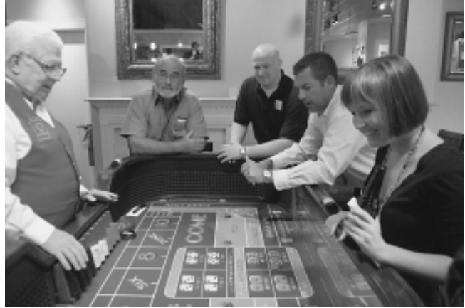
The dice table was always crowded during the Casino Night party for NARI members and prospects at Ferguson.

approaching 250 and should pass this milestone in a month or two. As the association grows in size and prominence in the region, the value of NARI membership and the NARI brand will increase. If you know a contractor or supplier that is not a NARI member, but should be, tell them about NARI and tell the NARI office about them!