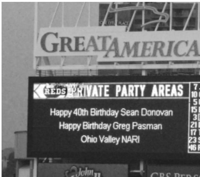
OVNARI received scoreboard recognition during the game.