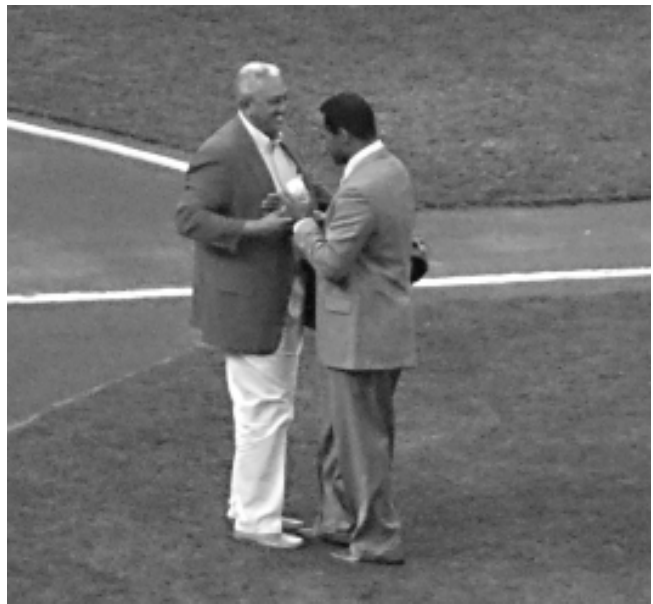
It's hard to imagine Barry Larkin having an "idol," but he does. It's David Conception, Reds shortstop from The Big Red Machine era. David (left) caught a ceremonial first pitch from Barry (right) before the July 19 game.